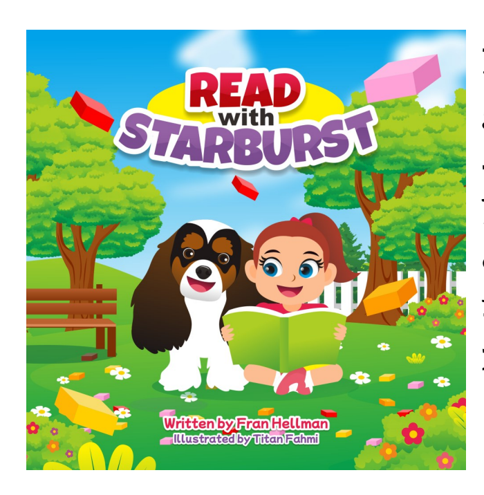
Fran's Story follows on next page!